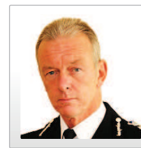
COMMISSIONER ■ Sir Bernard Hogan-Howe

STRUCTURE UNTIL APRIL 2015 WHEN: Central Area to be amalgamated into the North Area